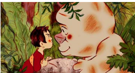
Mia and the Migoo